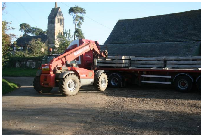
Unloading sleepers for the new cow track

As I write in late March, although it is wonderful to have such clement weather, we are beginning to want a bit of rain! We hope to turn out the cows in the next few days as it has dried up so much underfoot and we now have a good concrete sleeper cow track in the main grazing field, but the grass now needs some warm rain to really get it going.